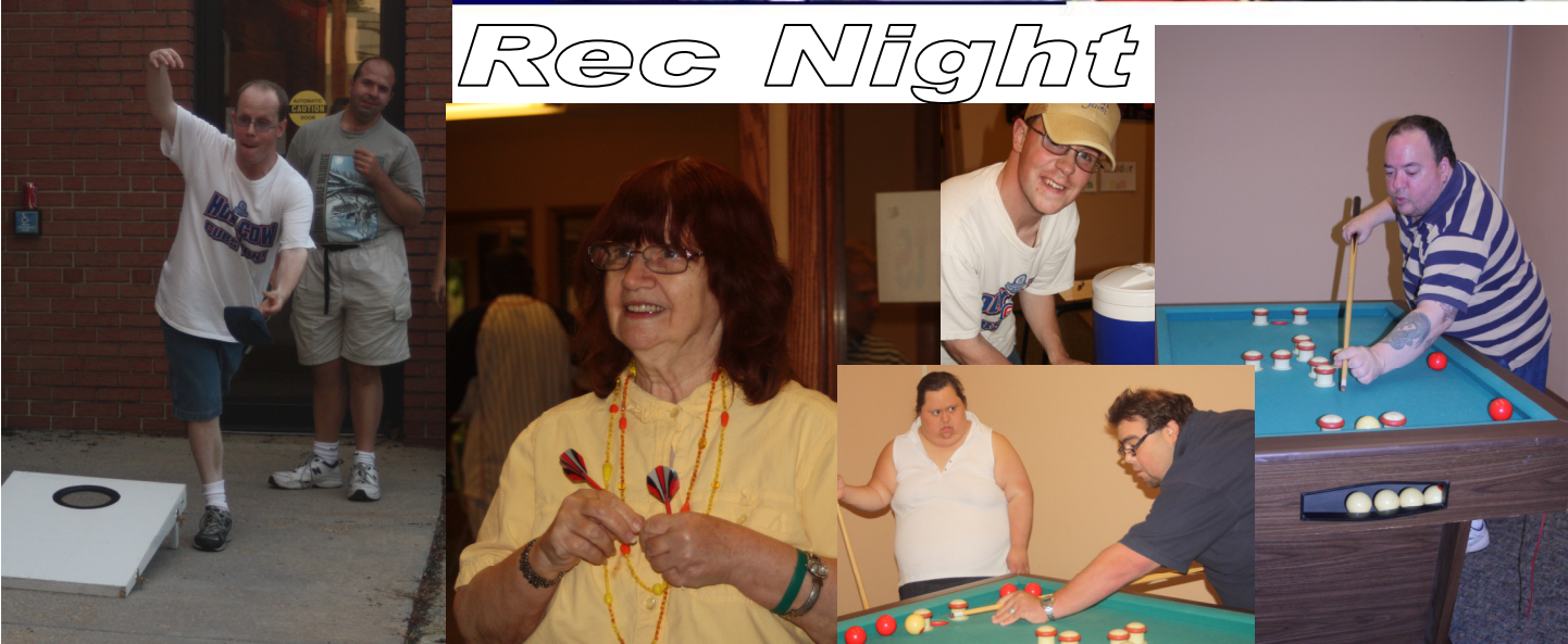
Chapter of The Arc of Illinois and Arc US